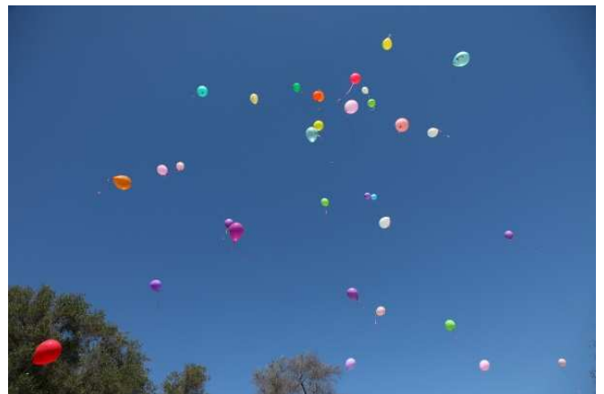
An Enjoyable Picnic

So many stepped up in helping to make this event a success.